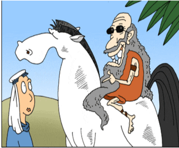
(See Genesis 5:27) 09-16-2005

SOMEWHERE AROUND FOUR HUNDRED YEARS METHUSELAH BEGINS HIS MIDLIFE CRISIS