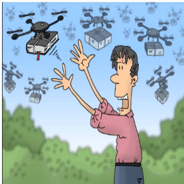
(See Matthew 28:19) 06-27-2014

Inspirational Quote: “ The power of prayer is found in the heart of the believer! ”