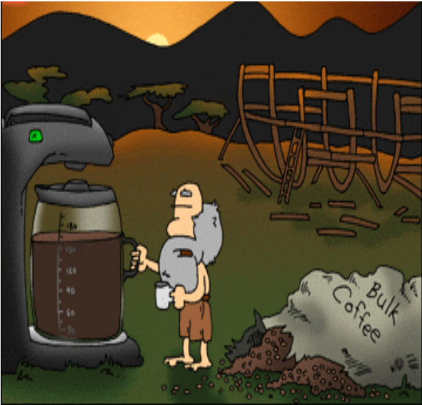
(See Genesis 6-8) 04-05-2010